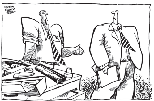
"You shouldn't have told the employees to 'work smarter.' They all went and joined a union."

They may tell you that you will never get any benefit from paying union dues.