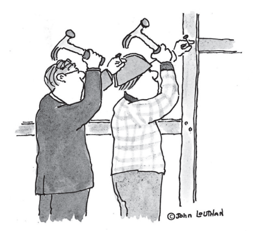
"Management and labor working in tandem."

They may tell you that you will not be able to speak with your supervisors or managers and that you will have no control over what is decided in your workplace.