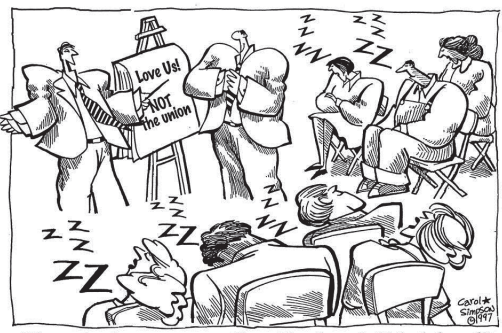
"Our anti-union message must be getting through. Nobody booed."

This committee will do the company's dirty work. They may distribute leaflets with lies about the IBEW, start rumors, or intimidate workers that support the IBEW.