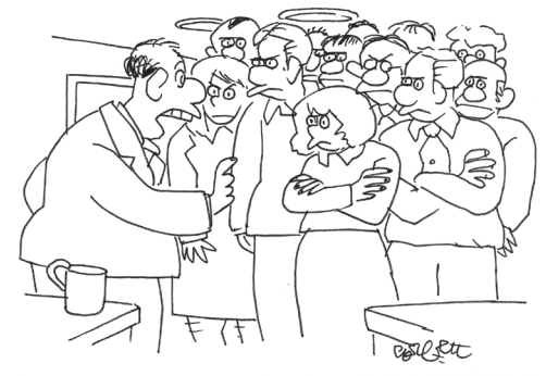
"YOU CAN'T VOTE TO LINIONIZE - YOU'RE ASSOCIATES NOT EMPLOYEES!"

This booklet can help you anticipate how the company will respond to your demand for democracy in the workplace.