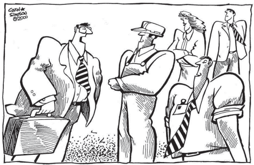
"...and stop smirking when I spread nasty rumors about the union. I have feelings too, you know."

The company will attempt to portray the authorization card as a legal document that makes you a member of the union and requires you to immediately begin paying dues—without the right to vote on a contract