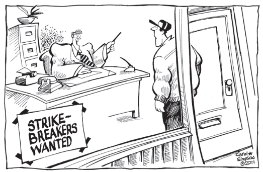
"We're not asking you to sell your soul.... we'd just like to rent it for a while."

They may tell you that while you are out during a strike you will be permanently replaced. They may ask you how you will support yourself and your family if you are forced to join the strike.