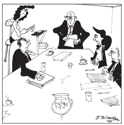
"Drop dead. Well that's a good start to our negotiations."

It is illegal for the company to say this to you directly, so instead they may say something like, "Remember, we don't have to agree to what you want in the contract."